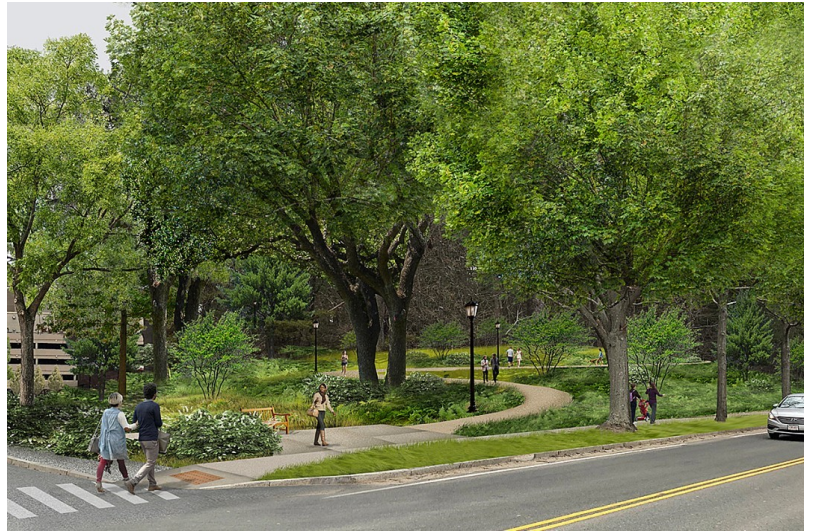
Pine Tree Preserve

Located on Thomas More Road across from the Chestnut Hill Reservoir, the Pine Tree Preserve will feature pedestrian walkways, park benches, viewing areas, and lighting, and will be open to the University community and general public. The project stems from an agreement between the Massachusetts Water Resources Authority, which controls the parcel, and Boston College, which will oversee maintenance of the property.