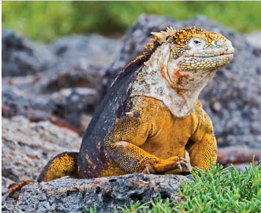
We'll encounter iguana in the Galapagos.

Day 15: Quito/Depart for U.S. This morning we visit Quito's Botanical Gardens, featuring an orchidarium with more than 1,200 species of orchids; and Iaquito Market, a colorful riot of fresh produce and