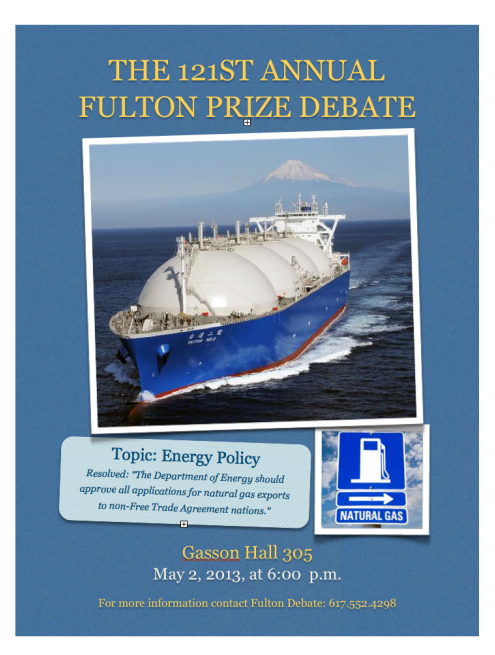
Poster for the 2013 Fulton Prize Debate