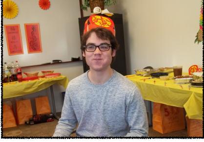
KING SULLIVAN. Who says that Fultonians don't enjoy dressing up?