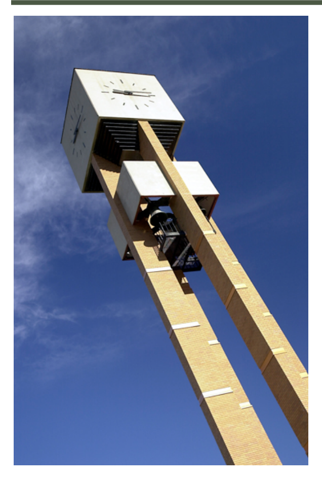
The Stewart Bell Tower at Weber State University, host of the 2013 National Debate Tournament