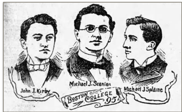
Boston College's First Intercollegiate Debate: The Fulton Debating Society of Boston Colleges vs. The Philodemic Society of Georgetown, April 22, 1895