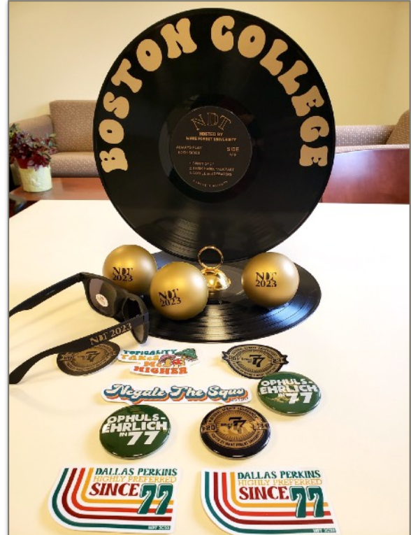
Swag from the 77th National Debate Tournament hosted by Wake Forest University