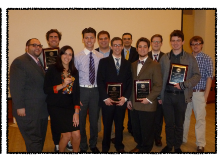
SQUAD PHOTO. Current Fultonians pose for picture (with awards) after the banquet.