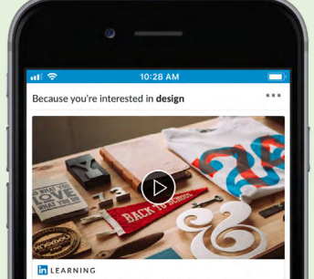
Designing for Additive Manufacturing: FDM

One click and the course starts playing right in your newsfeed.