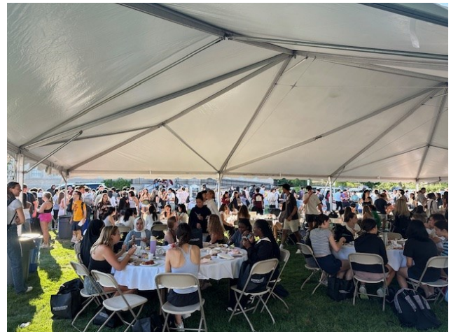
The 15th Taste of Off Campus welcomes off campus students and the community for a meet and greet and to sample the delicious cuisine of local restaurants.