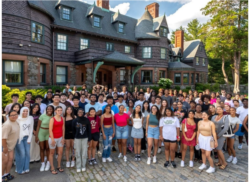
The inaugural class of BC's new Messina College arrived on campus in July.