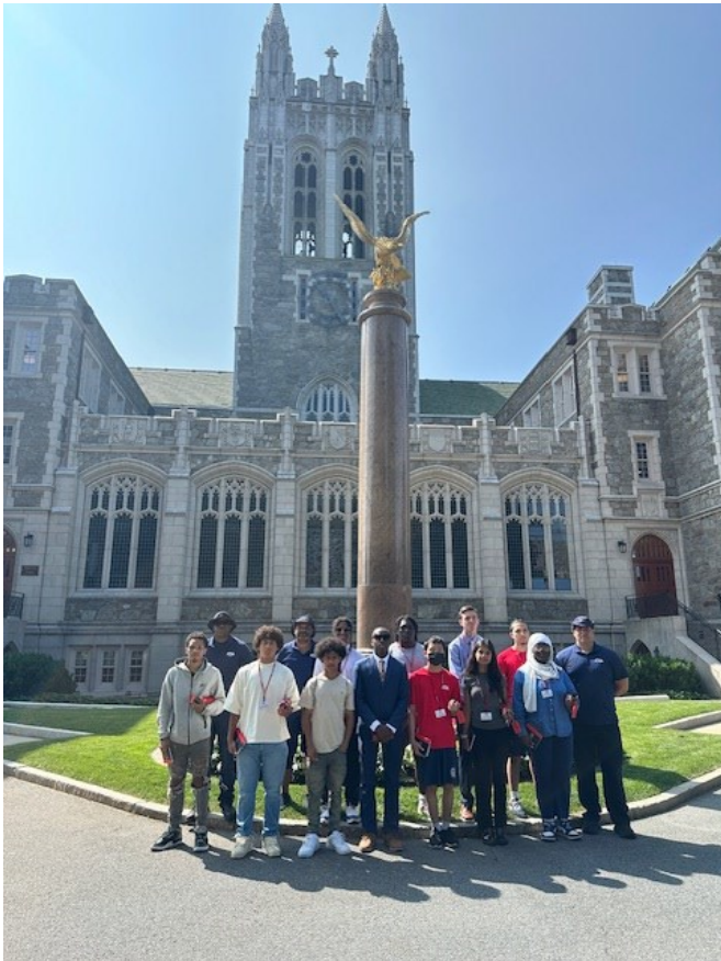
Now in year five of a partnership with the Boston Fire Department, BC hosts the students and mentors of the Teen Fire Academy for the 2024 summer admission session and campus tour.