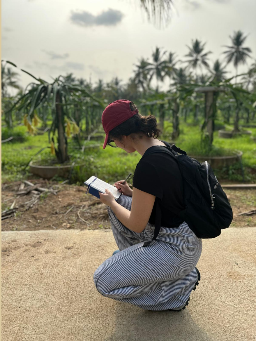
3rd Summer Renck - Ireland