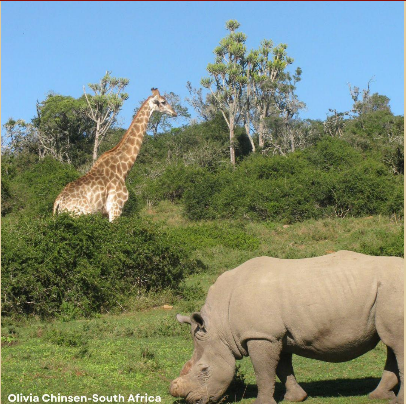
Olivia Chinsen-South Africa