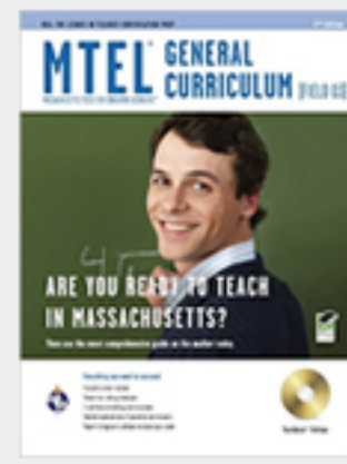
MTEL General Curriculum Brief abstract on book Publisher, date