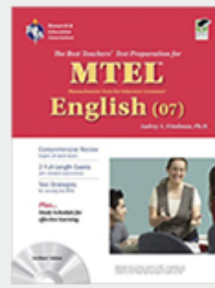
MTEL English (07) Brief abstract on book Publisher, date