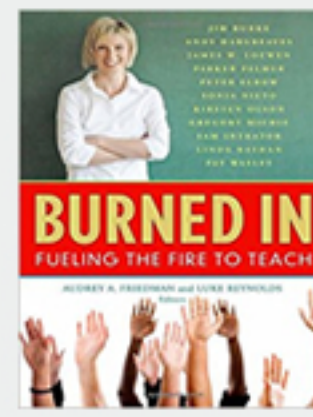
Burned In, Fueling the Fire to Teach Brief abstract on book Publisher, date