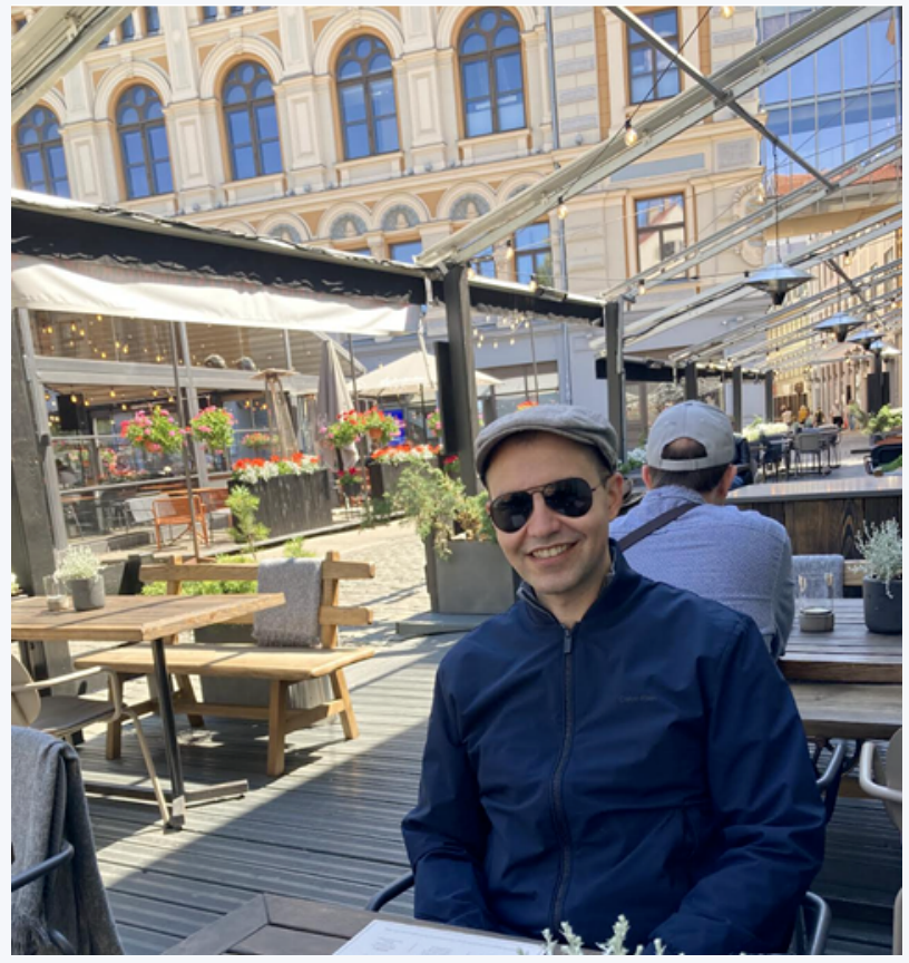
What Are Schiller Students Up To?