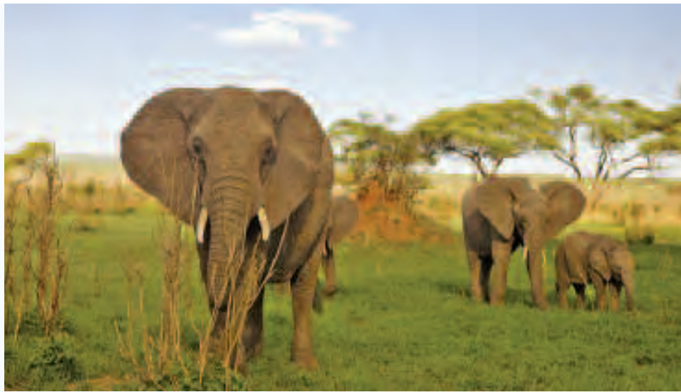
Across the plains of the Serengeti, families of elephant migrate to the lush grasslands in search of water, food and a place to rest.

famous inhabitant, the lion, who likes to climb and languidly lie draped over the branches of the acacia tree.