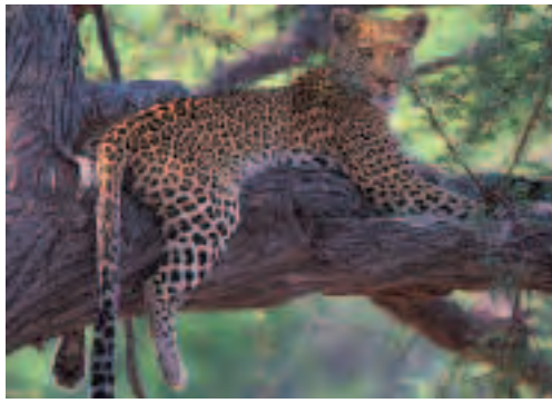
Watch for the elusive leopard, a master of concealment, relaxing on large tree branches.