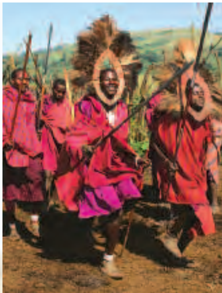
Masai proudly perform the ritual of their forefathers in traditional attire.

of grazing animals, who in turn attract lion, leopard and cheetah.