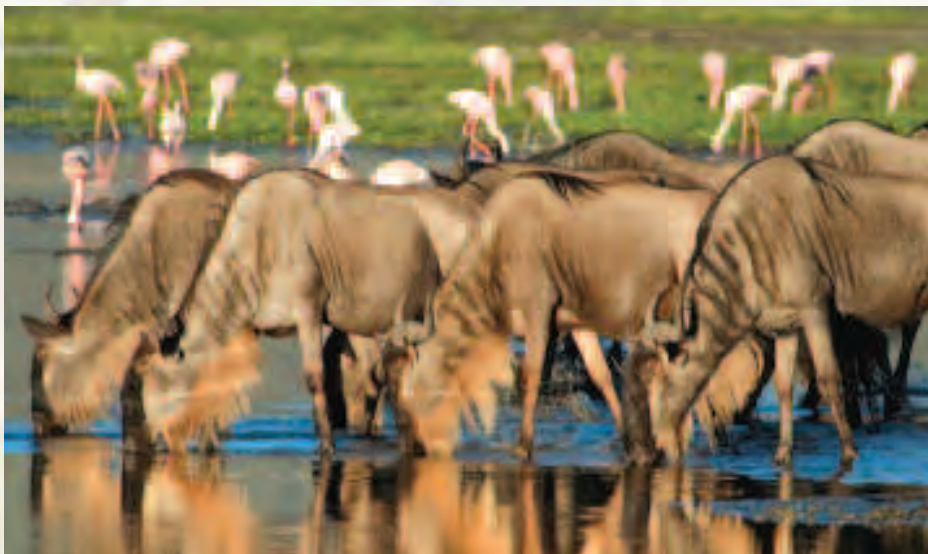
Watch for wildebeest quenching their thirst at a Ngorongoro Crater watering hole where brilliantly pink flamingo feed in the shallows.

Return to the lodge for lunch and enjoy the afternoon at leisure. View the crater and its abundant wildlife from your hotel's viewing terrace, perched on the crater's rim.