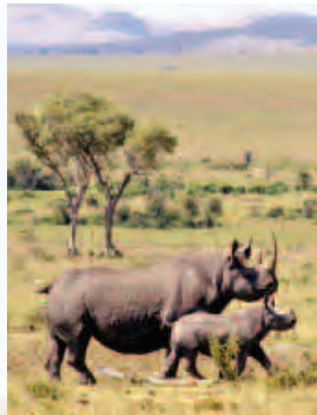
The Serena Lodge offers spectacular views, like this one of a black rhinoceros and its offspring.