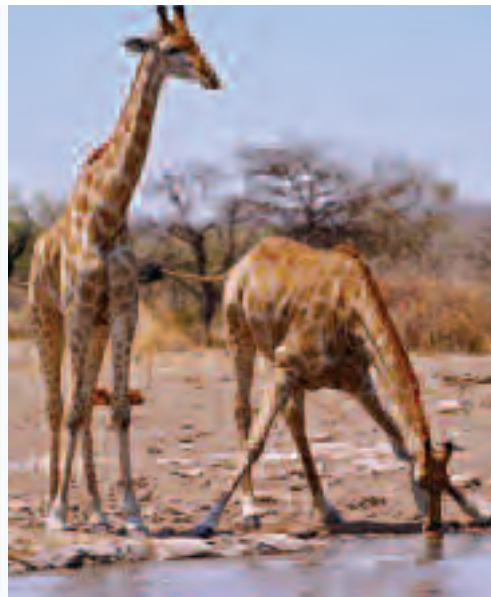
Giraffes can go weeks without stooping to drink, relying instead on water from dew and acacia leaves.