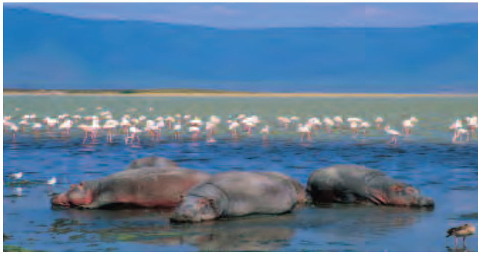
Ngorongoro Crater's wetlands offer a cool sanctuary for a pod of hippopotamuses, which can run as fast as 30 miles per hour and may weigh more than 4,000 pounds.