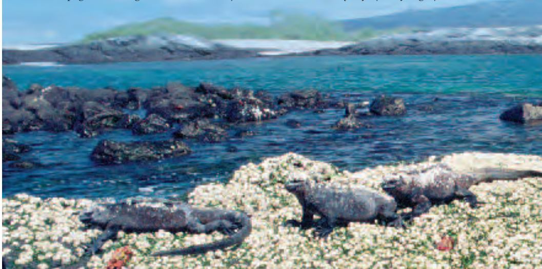
Photo this page: Marine iguanas bask in the afternoon sun in the company of Sally Lightfoot crabs.

Cover photo: Blue-footed boobies are a common sight along the rocky shores of the Galápagos, where they congregate to nest and mate.