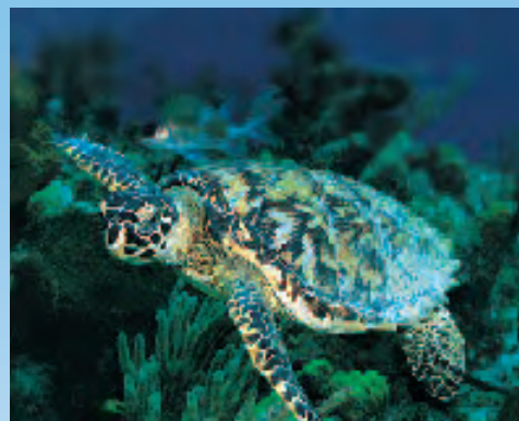
The graceful Pacific green sea turtle is the only marine turtle to nest regularly on Galápagos beaches.

Arrive this morning on the shores of San Cristóbal, the first Galápagos island Darwin landed on in 1835. Transfer to the airport and fly to Guayaquil. Invigorated by trade with the Far East, this city became one of the wealthiest on the continent, a status that made it a favored haven for English and Dutch buccaneers in the 17th and 18th centuries. See the historic markets and shipyards; visit famous Bolivar Park, where playful iguanas scamper through its grounds; and stroll past historical and cultural monuments along the Malecón 2000 promenade overlooking the Guayas River. Check into the deluxe HILTON COLÓN HOTEL and join your traveling companions for a farewell reception.