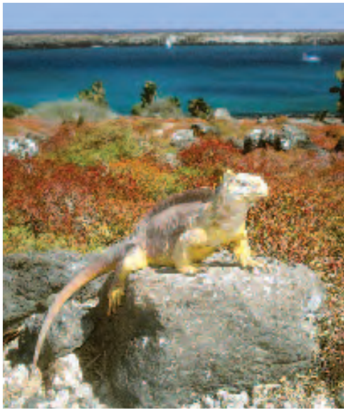
Observe, as Charles Darwin did more than 150 years ago, the distinct creatures indigenous to the Galápagos Islands, like this land iguana.