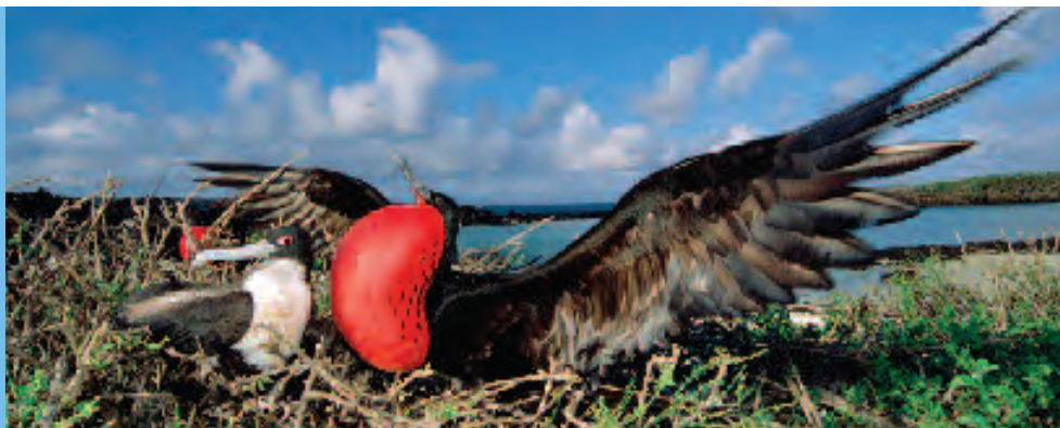
Look for the unusual mating “dance” of the magnificent frigate birds, one of the Galápagos Islands’ hallmark species.