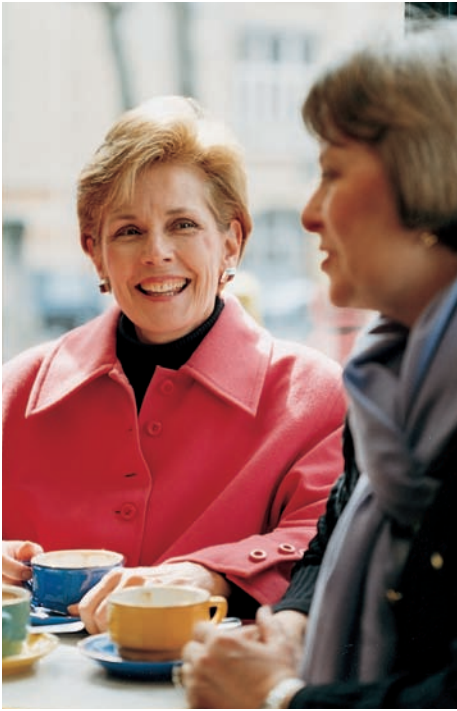
Enjoy a café au lait and lively conversation in Paris.