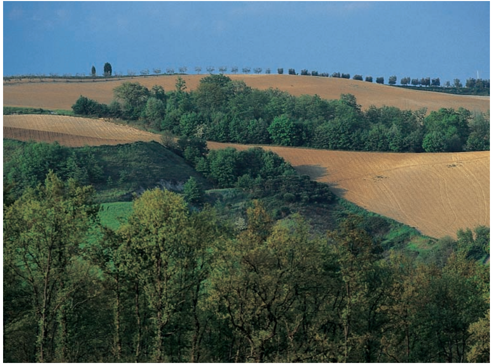
Fall in love with the rustic rolling hills, brilliant light and medieval towns of Tuscany.