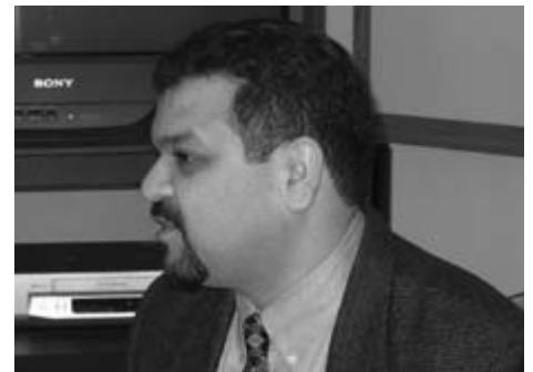
Huda speaks at the Boisi Center

18th-19th century reformist movements which tried to apply modern methods to religious studies and to contest colonialism. With the creation of independent states, these Islamic parties were marginalized, and even violently oppressed by the secularist nationalist regimes of leaders such as Pahlavi in Iran, Ataturk in Turkey, and Nasser in Egypt. This began to change in the mid-1970’s when elements within the Saudi Arabian royal family began to fund Islamic thinkers and organizations whose goal was to achieve unity amongst Muslim states. The political goal of this movement was to create a coalition of Muslim political parties that would counteract Arab nationalism, secularization, and unchallenged westernization. Some of the prominent religious thinkers and leaders produced a very “puritanical” understanding of Islam in which religion was a complete way of life encompassing the economic, political, and social aspects of daily living. This form of Islam, which has become known as “Wahabbism” also rejects all sources of knowledge outside the Qu’ran and rejects those