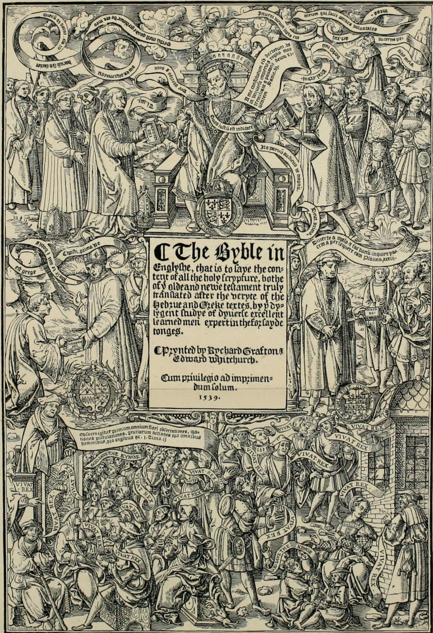
FAC-SIMILE (REDUCED) OF THE TITLE-PAGE OF THE GREAT BIBLE.