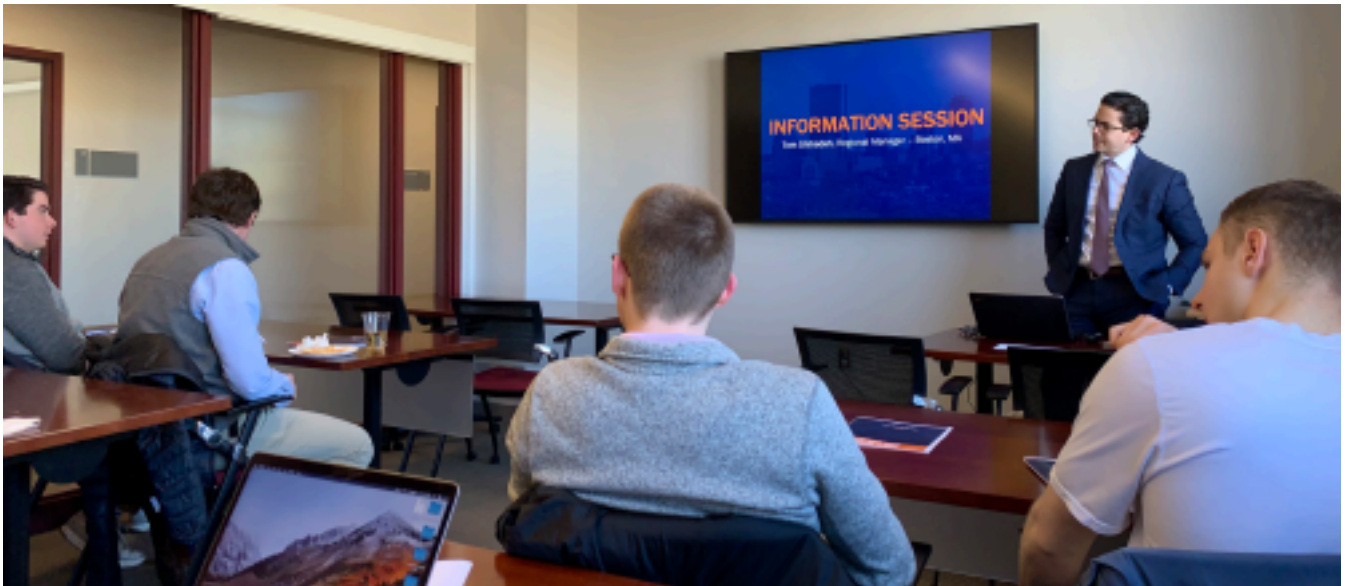
Students Participate in a Career Information Session, February 2020

Neighborhood Engagement: Create opportunities for multiple disciplines from across the University to engage in place-focused neighborhood strengthening.