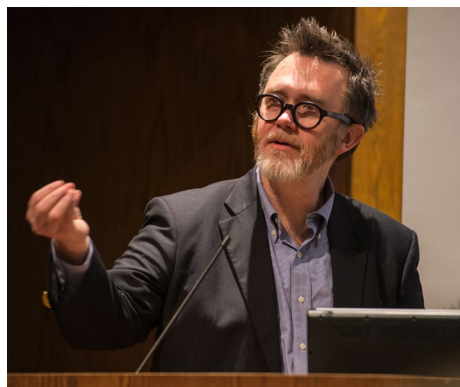
Journalist Rod Dreher speaking at a Boisi Center event about his new book on April 23.