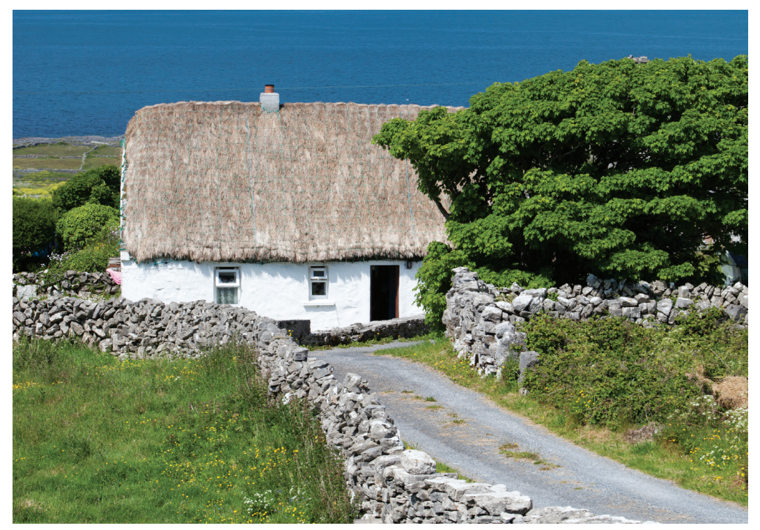
A scene from the Aran Islands, a place beloved by the Irish and by those who visit

galleries, and restaurants. An islander guides our tour here, imparting local lore along the way. We stop at Dun Aenghus Fortress, the three prehistoric stone walls crowning the tallest cliffs of Inishmore; have lunch in a local pub; and enjoy some free time before returning to the mainland and our hotel late this afternoon. Dinner tonight is at a local restaurant in the village of Bearna. B,L,D