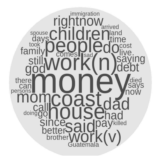
Figure 3. Living to Work, Working to Live and Love

Migrating for work and love. As suggested in the Word Cloud below (see Figure 3), love and work are performed through internal and external migration. Money is secured through borrowing, doing, and going, and always rooted in a belief that "one can." Maya are grounded in and committed to family (children, spouses, siblings, and parents) well-being and to sustaining home/house/land in Guatemala and, for many, in the presence of God—despite death, murder, disappearance, and sadness. The Word Cloud analysis reiterates and confirms the discursive constructions and transformative performances through which parents' crossings of multiple borders, civilly disobediently challenge migratory regulations and walls, thereby centering and re-centering their human rights to work and their own and their families' well-being [buen vivir].