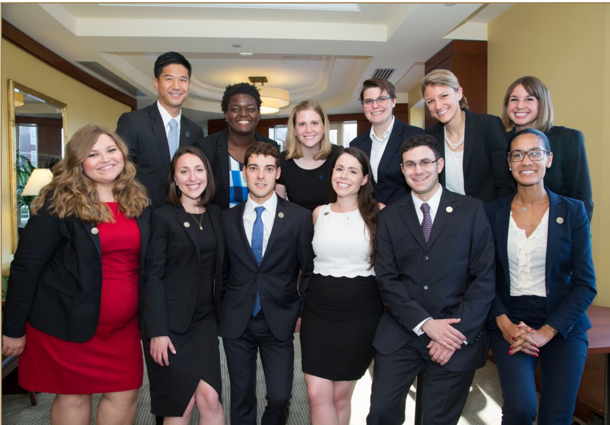
2015 Rappaport Center Fellows

The Rappaport Fellows Program promotes future civic leaders and policy makers.